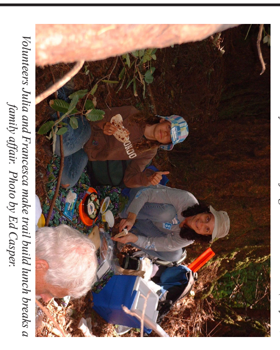
Building, Preserving and Promoting Local Trails